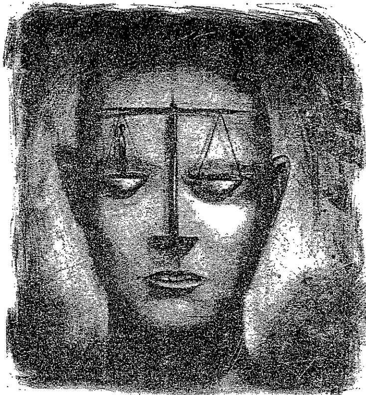
BY JON KRAUSE FOR THE WASHINGTON POST